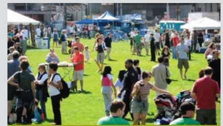
Riverfest 2008 a big success!