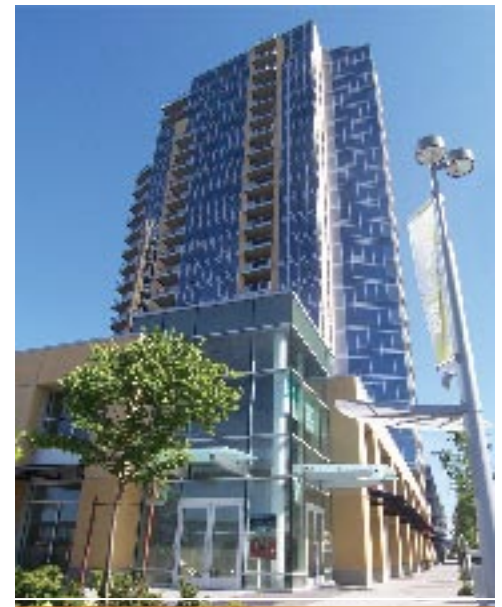
Meet you at the corner store: The Meriwether brings retail to the district at last.

Between the Meriwether Towers | Residents only