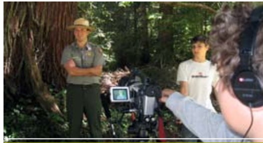
We're rolling, ranger: A scene from last summer at Documentary Explorers Camps for kids.

Find Current Events , a calendar for SWF residents and the public, on the back of this newsletter.